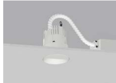
RPT / RWW / WWL