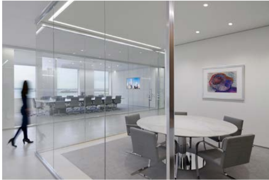
3" round recessed wall washer with half moon regressed light aperture with flush kick reflector.