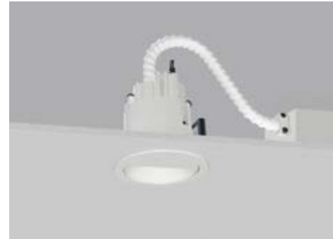
RBT / RWW / WWL