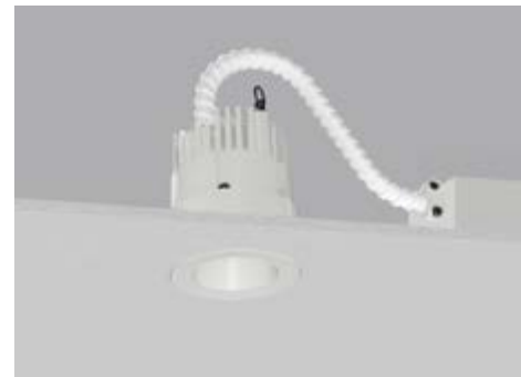
RPT / RFPH / OA