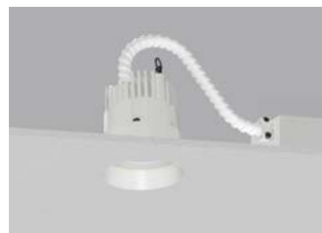
RPT / RRPH / RSC