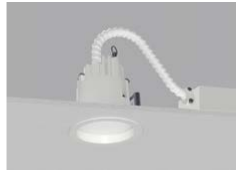
RBT / RRD / MPO