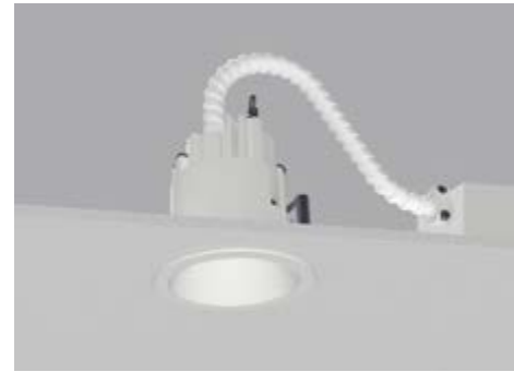
RBT / RRC / OA