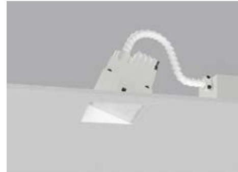
RBT / SAWW / MPO