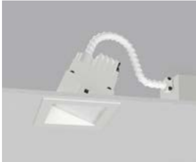
Bezel Trim (RBT)