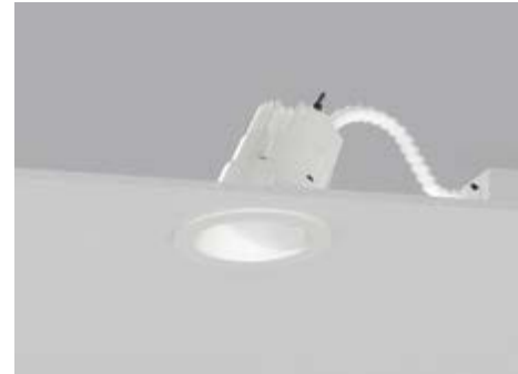
RBT / RAWW / MPO