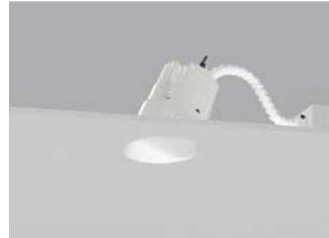
RBT / RAWW / MPO