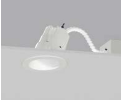
Bezel Trim (RBT)