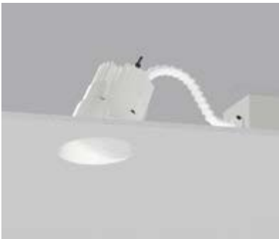
Plaster Trim (RPT)