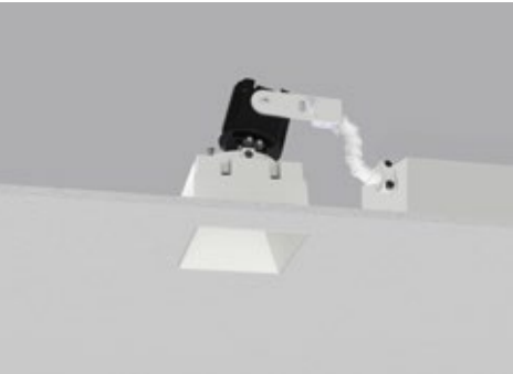
RPT / SRD / MPO