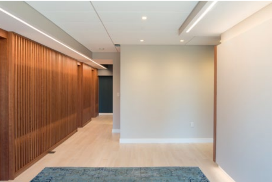
3" square aperture recessed adjustable downlight with 1.6" diameter regressed light aperture. Tilt 40°, rotation 360° (continuous).