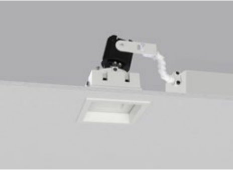
RBT / SRPH / OA