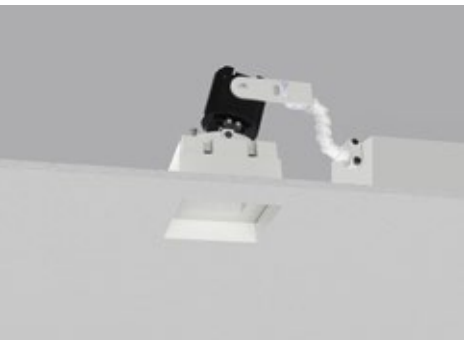
RPT /SRPH / RSC