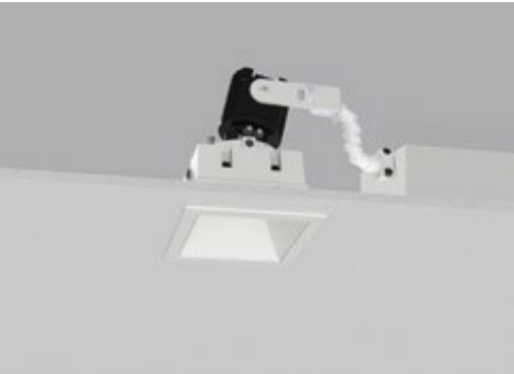
RBT / SRC / OA

*Minimum of 5" (126mm) ceiling void is required to install the integral driver from below the ceiling.