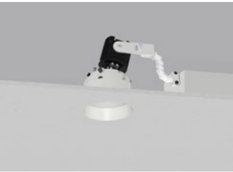
RPT / RRPH / RSC