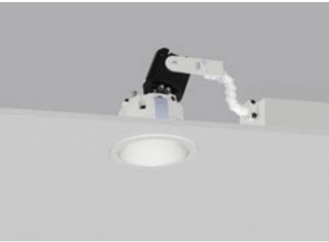
RBT / RRC / OA