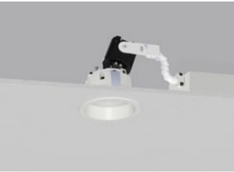
RBT / RRPH / RSC