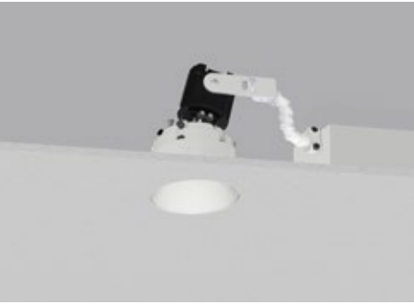
RPT / RRC / OA