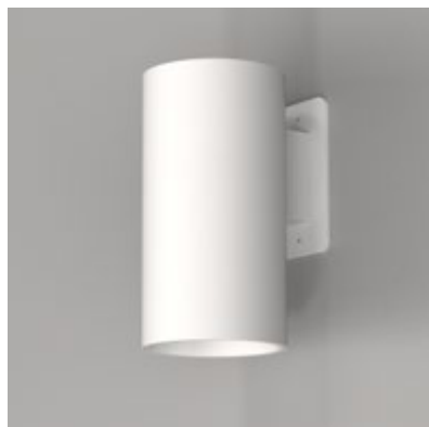
Surface wall mount (SW)