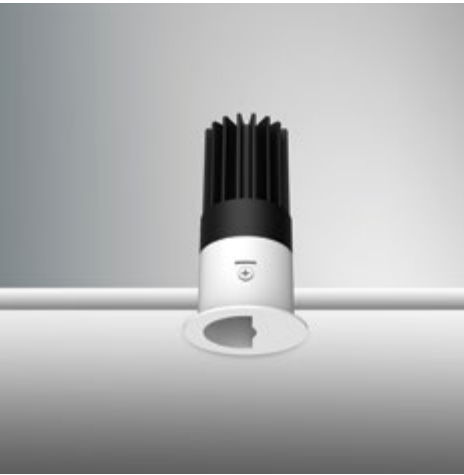
Recessed Bezel Trim (RBT)