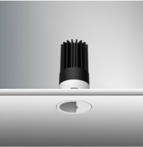
Recessed Plaster Trim (RPT)