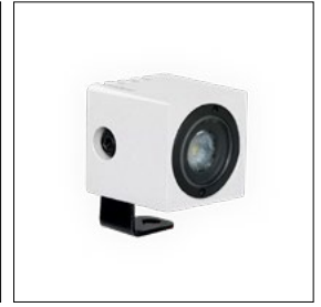
1.3" (2W) SWH