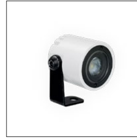
1.2" (2W) RWH

Warranty: 5-year Limited Warranty on fixtures. 1-year Limited Warranty on Remote Drivers.