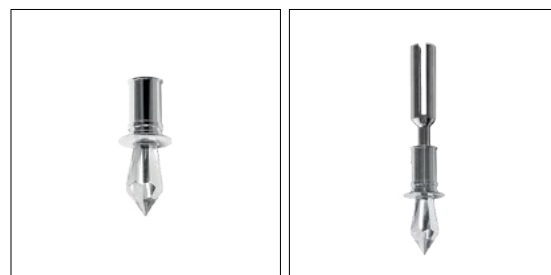
0.8" (1W CC)

Warranty: 5-year Limited Warranty on fixtures. 1-year Limited Warranty on Remote Drivers.