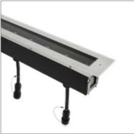
23" (44W) 42.9" (86W)

Lumen Maintenance: L70 projections tested at Tj 65° C and Ta 25°. Warranty: 5-year Limited Warranty on fixtures. 1-year Limited Warranty on Remote Drivers.