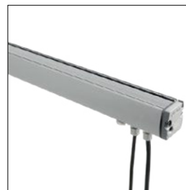
21.1" (13W) 46.5" (24W)

Warranty: 5-year Limited Warranty on fixtures. 1-year Limited Warranty on Remote Drivers.