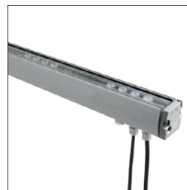
19.7" (8.5W) 46.5" (22.6W)

Warranty: 5-year Limited Warranty on fixtures. 1-year Limited Warranty on Remote Drivers.