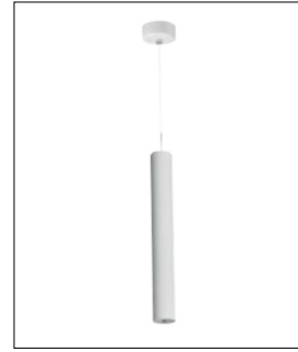
2.4" X 9.8" (7.5W)

Warranty: 5-year Limited Warranty on fixtures. 1-year Limited Warranty on Remote Drivers.