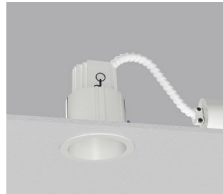
Micro-prismatic Opal (RMPO) / Bezel Trim (RBT)

Certifications ETL and ETL-C for dry and damp location, CE, Wet Location rated