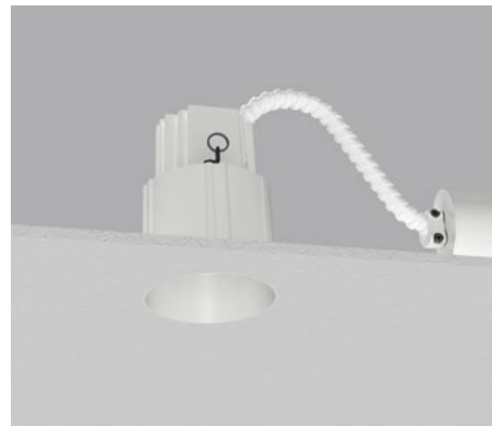
Micro-prismatic Opal (RMPO) / Plaster Trim (RPT)