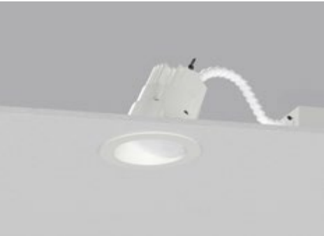
RBT / RAWW / MPO

*Minimum of 4.75" (120.7mm) ceiling void is required to install the integral driver from below the ceiling.