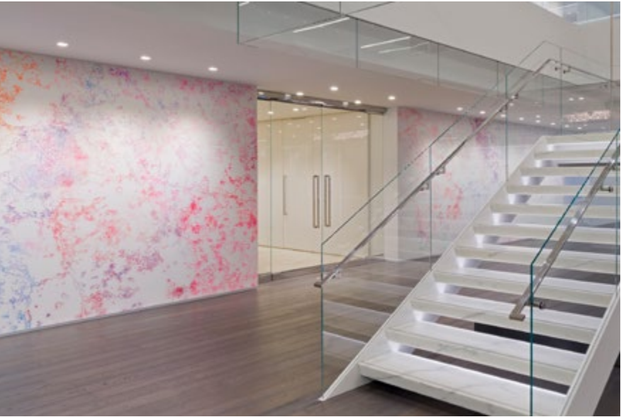
3" round recessed accent wall washer with regressed angled diffuser.