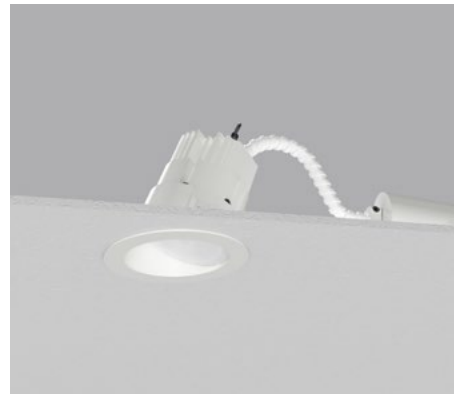
Accent Wall Wash (RAWW) / Bezel Trim (RBT)

Minimum of 4.1" (105mm) ceiling void is required to install the integral driver from below the ceiling.