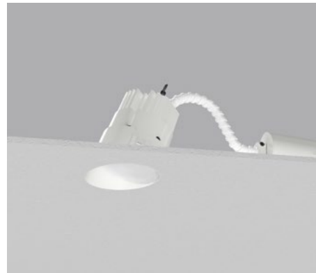
Accent Wall Wash (RAWW) / Plaster Trim (RPT)