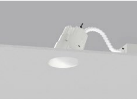
RBT / RAWW / MPO