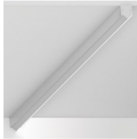
Surface Mount (SM)