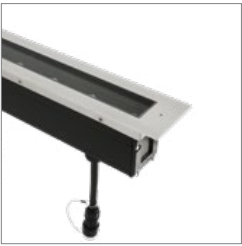
23" (51W) 42.9" (89W)

Lumen Maintenance: L70 projections tested at Tj 65° C and Ta 25°. Warranty: 5-year Limited Warranty on fixtures. 1-year Limited Warranty on Remote Drivers.