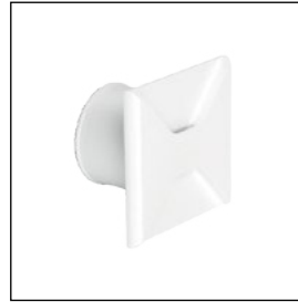
1.6" DE (1W)

Warranty: 5-year Limited Warranty on fixtures. 1-year Limited Warranty on Remote Drivers.