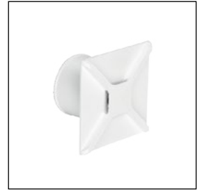
1.6" QE (1W)