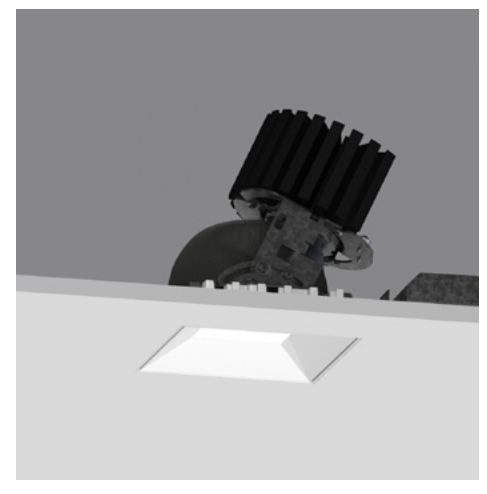
Recessed Plaster Trim

Housing Die-caste aluminum for precision fit and heat dissipation