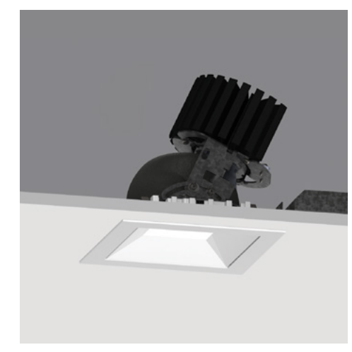
Recessed Bezel Trim

Certifications ETL and ETL-C for dry and damp location, CE