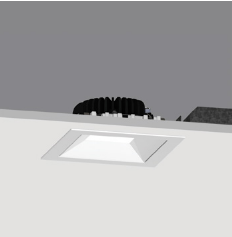
Recessed Bezel Trim