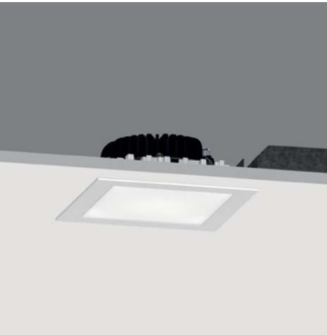
Recessed Bezel Trim