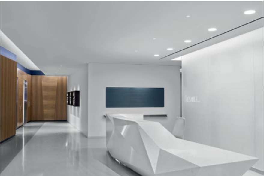
4" round recessed wall washer with half moon regressed light aperture and flush kick reflector.