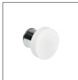
1.6" Round (1W)

Warranty: 5-year Limited Warranty on fixtures. 1-year Limited Warranty on Remote Drivers.