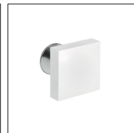
1.6" Square (1W)