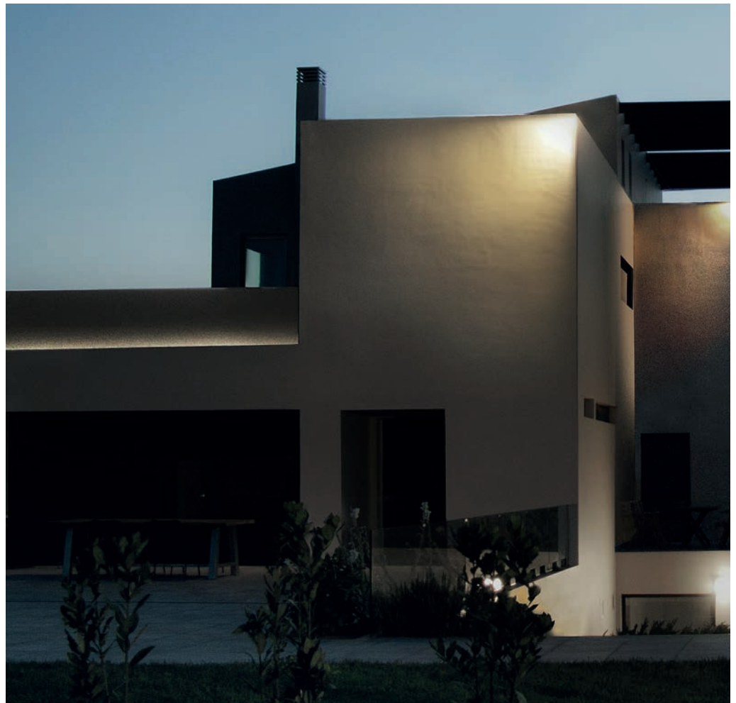
Private Villa | Athens, Greece

0-10V EldoLED SOLOdrive 100W for 1-8 fixtures