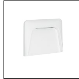
4.7" x 3.5"(1W)

Warranty: 5-year Limited Warranty on fixtures. 1-year Limited Warranty on Remote Drivers.