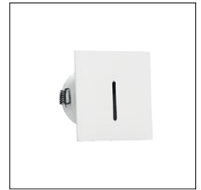
2.8" Square (2W)