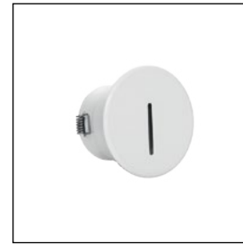
2.6" Round (2W)

Warranty: 5-year Limited Warranty on fixtures. 1-year Limited Warranty on Remote Drivers.