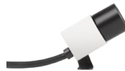
Eyelet65 with snoot accessory