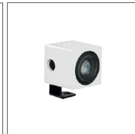
1.0" (2W) SWH