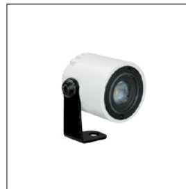
1.0" (2W) RWH

Warranty: 5-year Limited Warranty on fixtures. 1-year Limited Warranty on Remote Drivers.