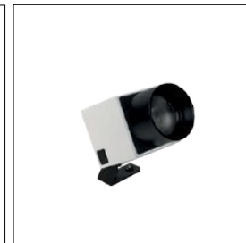
1.8" (6W) Narrow w/Integrated Snoot