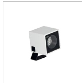
1.8" (6W) Fixed

Warranty: 5-year Limited Warranty on fixtures. 1-year Limited Warranty on Remote Drivers.