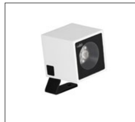
1.8" (6W) SWH Fixed

Warranty: 5-year Limited Warranty on fixtures. 1-year Limited Warranty on Remote Drivers.