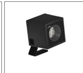
1.8" (6W) SBL Fixed