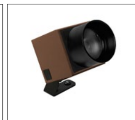
1.8" (6W) SDB Narrow w/ integrated Snoot