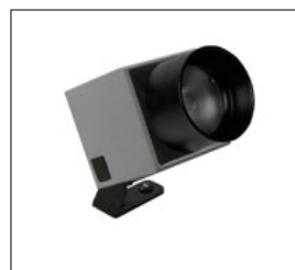
1.8" (6W) SGR Narrow w/ integrated Snoot