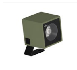
1.8" (6W) SGN Fixed