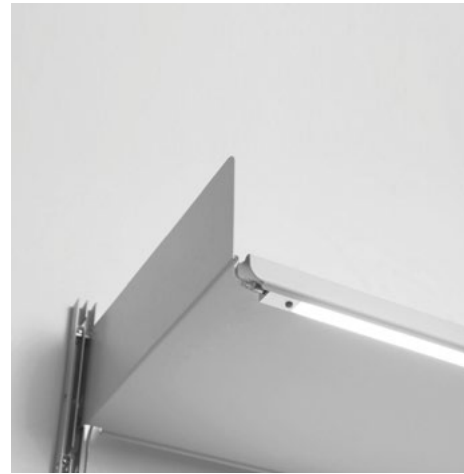
Under Cabinet (UC)