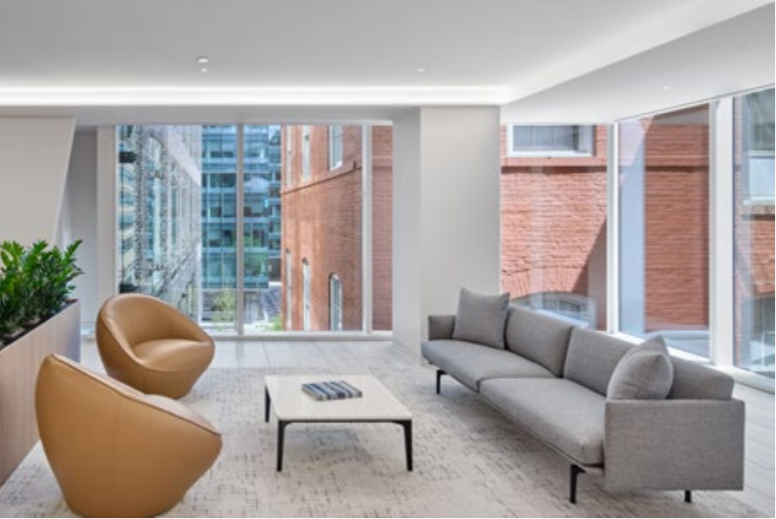
Non-illuminated cove system featuring plaster-in precision knife edge for clean, minimal effect.